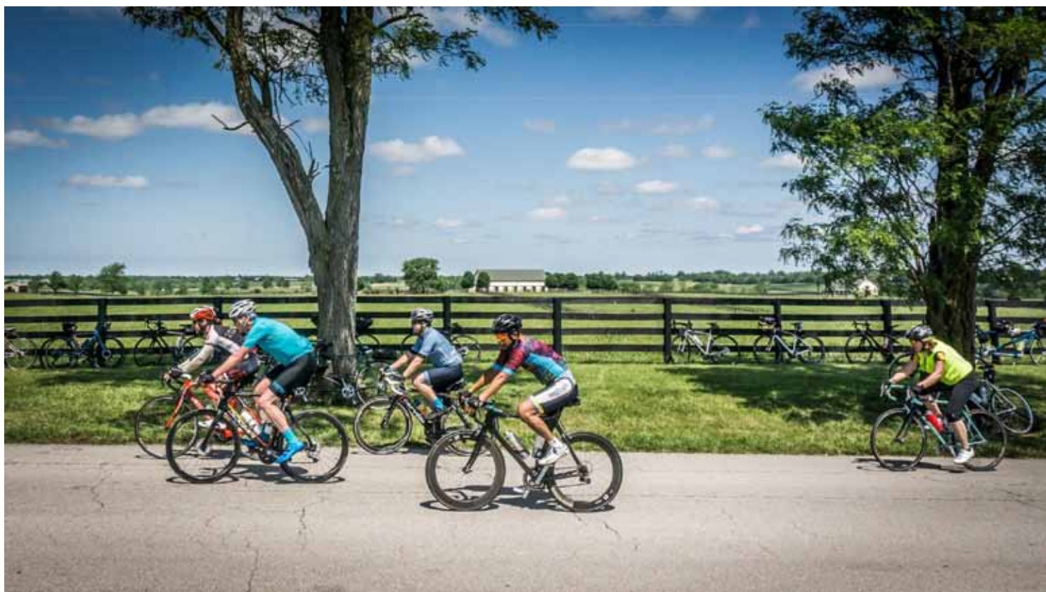
Photo from Memorial Day Weekend's Horsey 100 in Georgetown, KY