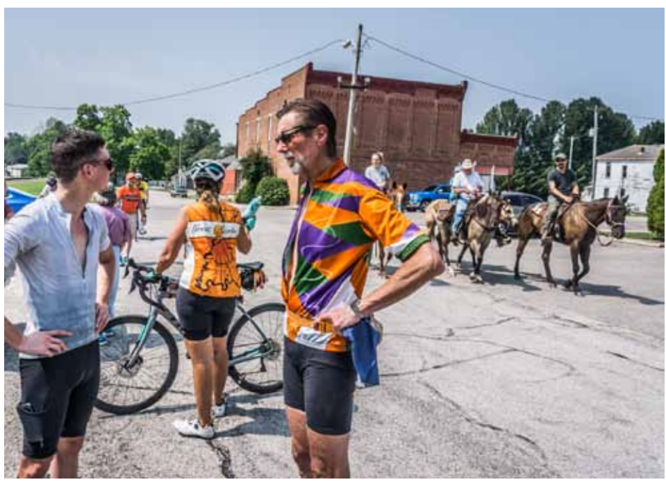
from the July 24th Korner Inn Ride from Elberfeld—two kinds of horsepower showed up today.