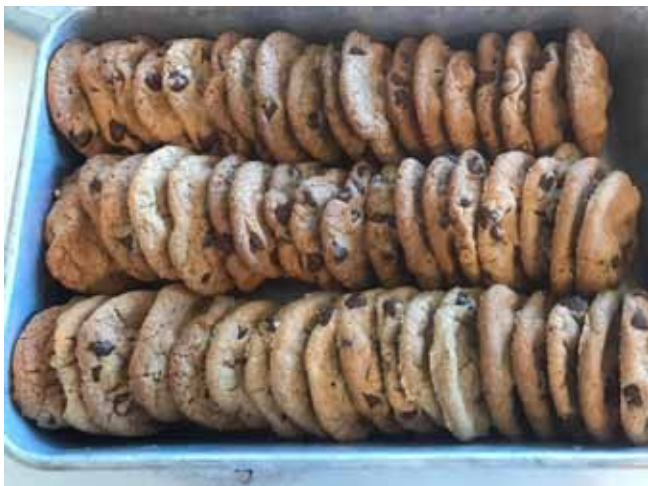
Bill's Birthday Cookie Ride