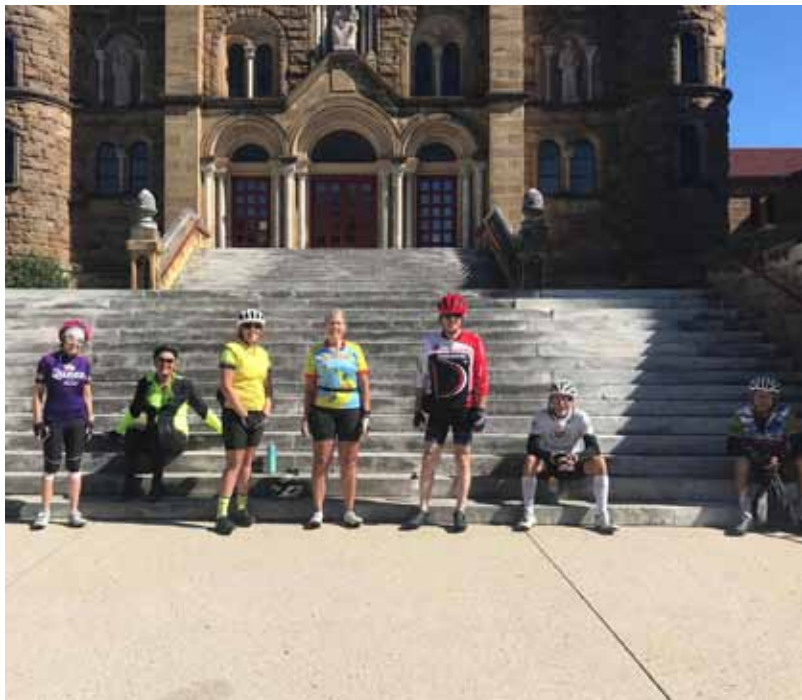
October Century Ride through St. Meinrad