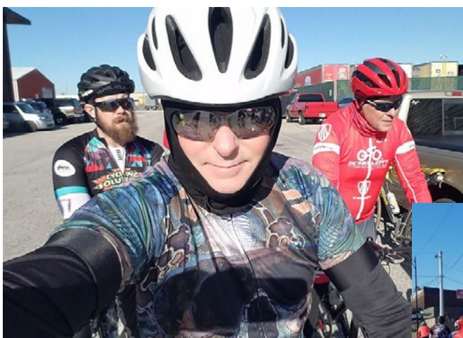
JANUARY 1, 2020 NEW YEAR'S RIDE PHOTOS FROM LAMASCO.