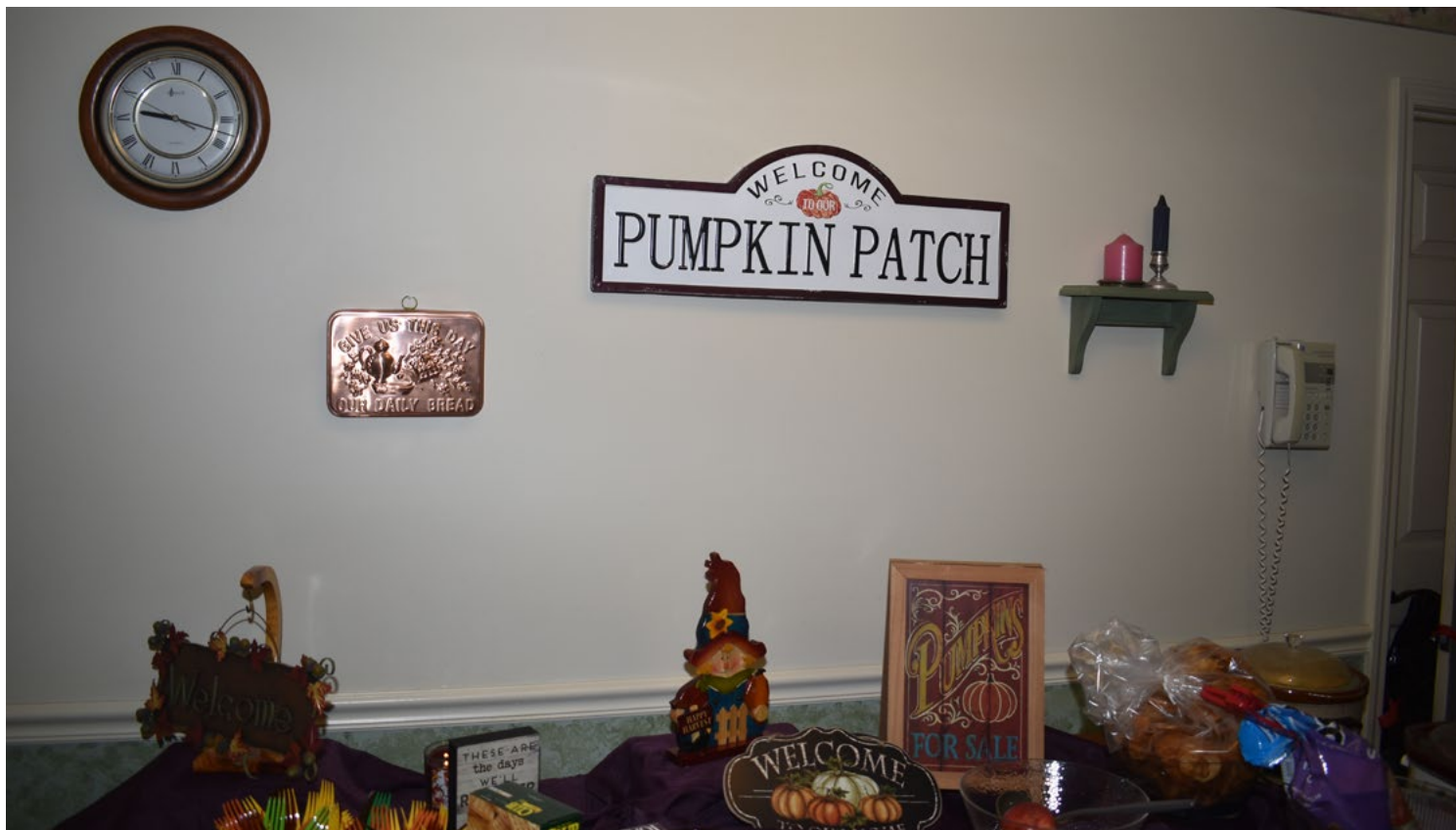
HOST TABLE FROM THE OLIVER'S PUMPKIN PIE (EAT-IN) RIDE IN NOVEMBER. THANKS TO GOOGLE, THE EDITOR WAS UNABLE TO DOWNLOAD MORE THAN ONE. SORRY.