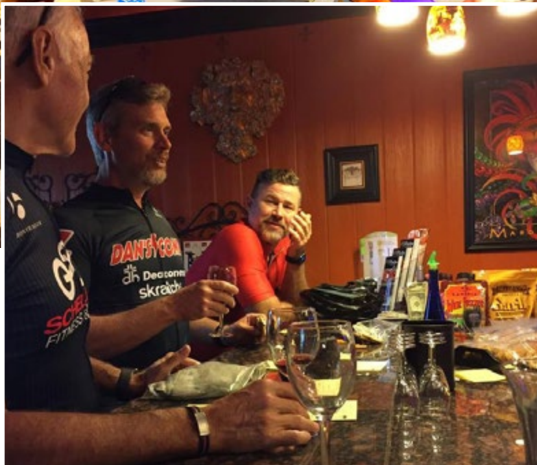
Left & Top, Mystique Winery Ride; Below, Trail of Tears Century