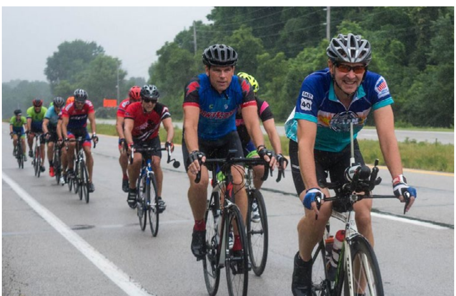
Clockwise, from upper left: July 27, Moonlight Ride (Kevin Otolski); July 25, 4H/Darmstadt Club ride (Mike Spearin); July 25, Ride Across Indiana (Kevin Otolski)