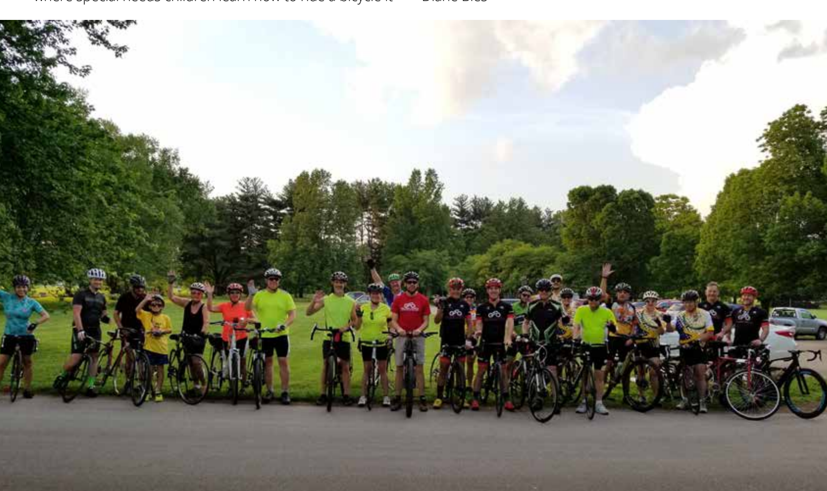
EBC RIDE OF SILENCE