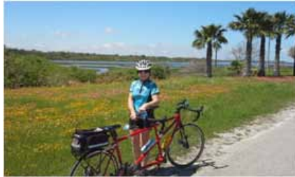
The stoker and the steed, a Co-Motion Speedster acquired in 2008