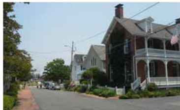
St. Michaels was a large fishing and trading port, now a tourist destination.

Routes selected here took the intrepid couple south down the coast to Salisbury Beach MA, and north up the coast to Ogunquit Beach ME the next day. Both routes were relatively flat with spectacular views of the ocean, coastline and impressive seaside cottages.