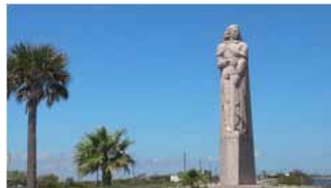
Robert de la Salle was unusually tall, apparently

Having explored what is now Montreal and all the Great Lakes, la Salle found his way down the Ohio and Mississippi Rivers to claim what became the Louisiana Purchase, then continued west to present day Texas, looking for a way to China. That man had vision!