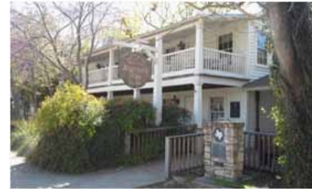
The venerable Stagecoach Inn, Salado TX

we checked in, though of more interest to the captain was the organized pub crawl that was also in progress on our arrival. The ride took us through the hill country and some stunning ranches, but the prospect of doing miles 71 to 85 against a particularly brisk headwind was too daunting for both captain and stoker at this early stage of the season; 70 was deemed sufficient.