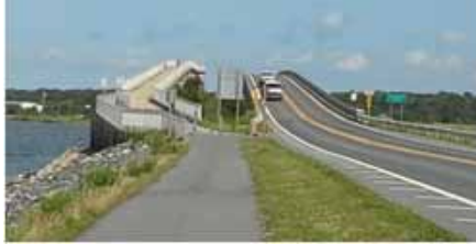
The bike trail across to Assateague has its own bridge – no traffic!

The stoker had long wanted to see Chincoteague and Assateague, part of the barrier islands just off the Delmarva (Delaware-Maryland-Virginia) Peninsula that forms the eastern shore of Chesapeake Bay. Chincoteague is a popular, lively resort and a Wildlife Refuge well suited to a casual bike tour, dead flat and with a road loop closed to traffic part of the day, allowing leisurely travel and wildlife watching. It also is infested with voracious mosquitoes who are undaunted by liberal application of repellent. The only solution is to go faster than 12 mph, top speed of even these supercharged babies.