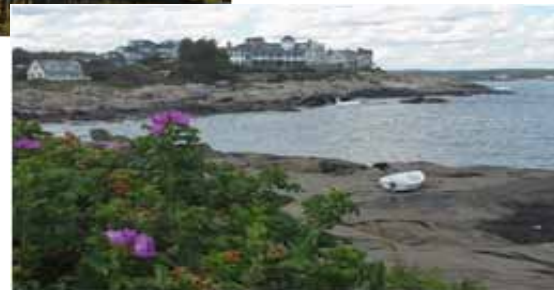
The New England coast is populated with seaside "cottages".

More adventures of From Sea to Shining Sea continued next month.