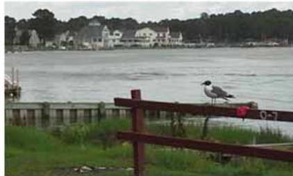
Channel at Chincoteague where the horses are swum across to auction.

Assateague Island is home to a herd of about a hundred wild horses, said to be descended from Spanish galleons wrecked in the 1600s or 1700s. They roam freely over this long, narrow island and are rounded up once a year and swum across a tidal channel to Chincoteague where the yearlings are auctioned off. The first such swim was in 1925 and the proceeds used to fund the local volunteer fire department; these days the auctioned animals are donated back to the herd and the proceeds used to support the wildlife areas.