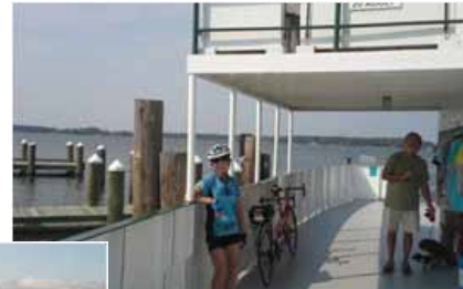
The stoker ferries across the Tred Avon River.