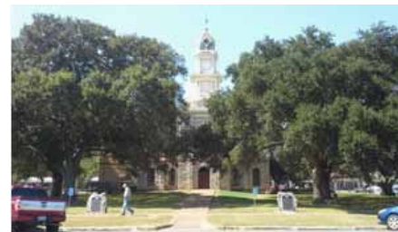
Goliad courthouse (1894), complete with the "Hanging Tree" (on right)

Texas in the fall is almost as beautiful a spring. The plan was to ride the Missions Tour de Goliad, a metric century and excellent ride for a tandem. Our front derailleur cable came untracked and we had only the middle ring, but that was fine, though we could have used the big ring on descents (read: no steep hills). But, while the route was excellent, there was nary a mission to be seen, which is unfortunate. The Goliad Mission and Presidio La Bahia were established in Goliad in 1759 and are an excellent historical park today. In 1835, the first Texas Declaration of Independence (from Mexico) was signed in Goliad, but Mexico's Santa Anna (of Alamo fame) recaptured the Presidio and in 1836 executed 342 Texan prisoners, far more than in any other (more famous) Texas battle.