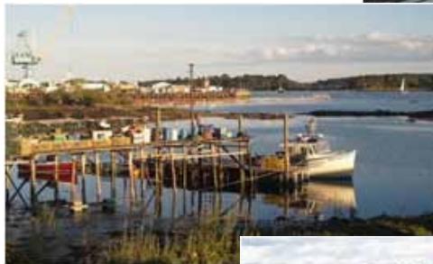
Portsmouth harbor and US Navy Shipyard