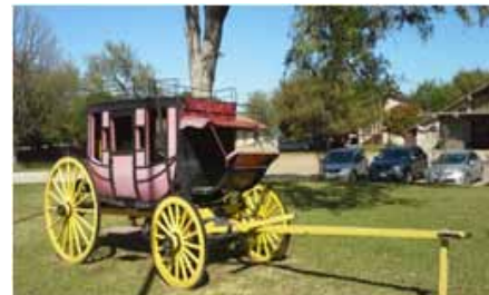
And the venerable stagecoach, Salado

Texas in the fall is almost as beautiful a spring. The plan was to ride the Missions Tour de Goliad, a metric century and excellent ride for a tandem. Our front derailleur cable came untracked and we had only the middle ring, but that was fine, though we could have used the big ring on descents (read: no steep hills). But, while the route was excellent, there was nary a mission to be seen, which is unfortunate. The Goliad Mission and Presidio La Bahia were established in Goliad in 1759 and are an excellent historical park today. In 1835, the first Texas Declaration of Independence (from Mexico) was signed in Goliad, but Mexico's Santa Anna (of Alamo fame) recaptured the Presidio and in 1836 executed 342 Texan prisoners, far more than in any other (more famous) Texas battle.