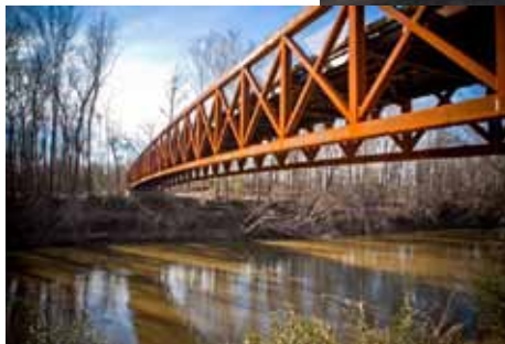
The 200 ft. Wolf River Pedestrian Bridge at the head of the Wolf River Greenway