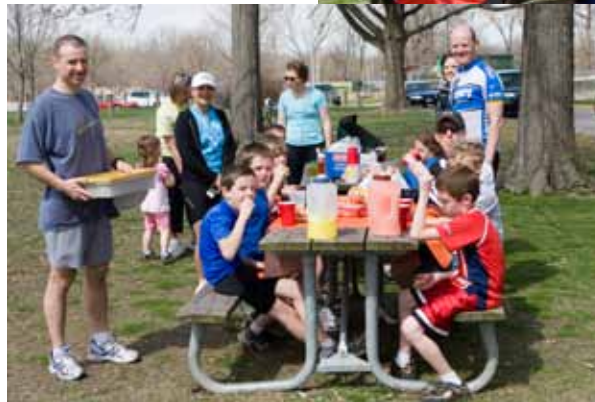
Spring Break Kids Ride Feeding Frenzy