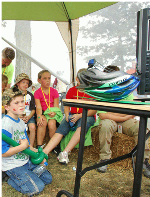
Attendees at Jake's Day watch a video on bike safety.