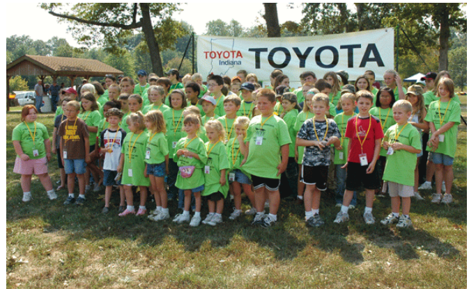
Close to 100 kids attended activities at Jake's Day.