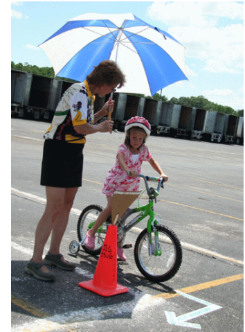
This young girl enjoys some shade before turning.