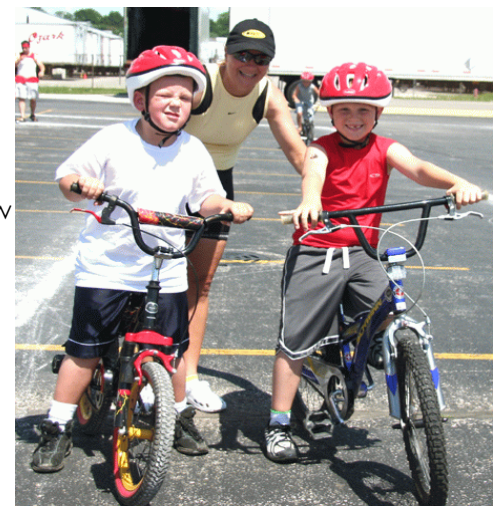
Two boys show off their bikes and new helmets.