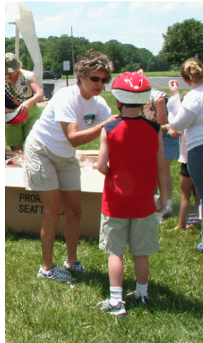
A new bike helmet is fitted for an attendee.