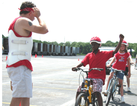
Some crazy guy in a back brace teaches hand signals on the bike course.