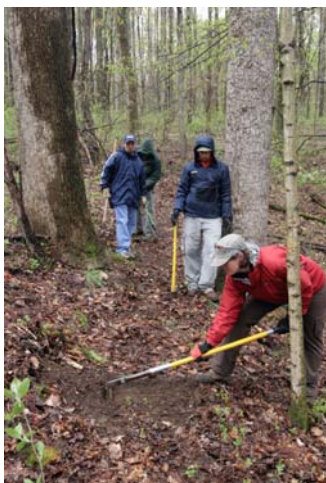
(Top Left and Top Right) EBC members use their classroom training to start building a trail.