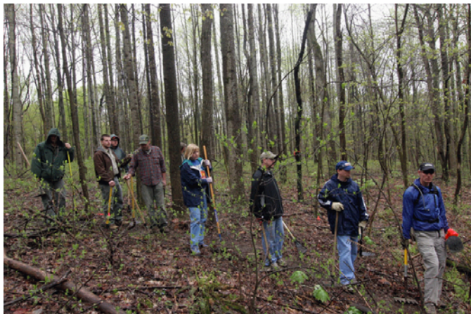
EBC Members head towards an area where a path will be made.