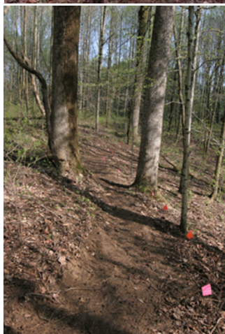
(Right) A portion of the finished trail.